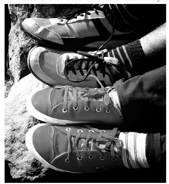
Friday and Tnesday Let's go!

Accompanied by members of the Lezig'zagueurs (hiking/rambling club based at the Maison des Jeunes) Much to see and a lot to learn about the local countryside